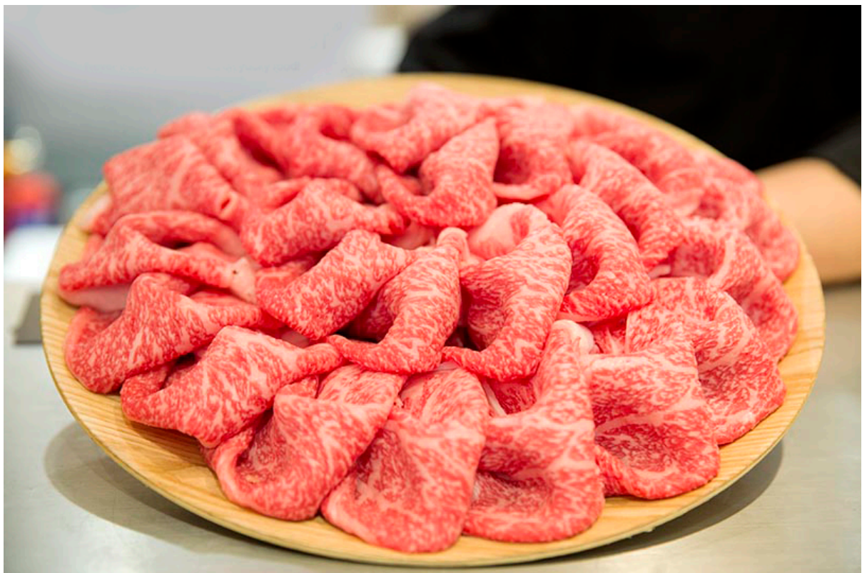
SAGA A5 Sukiyaki